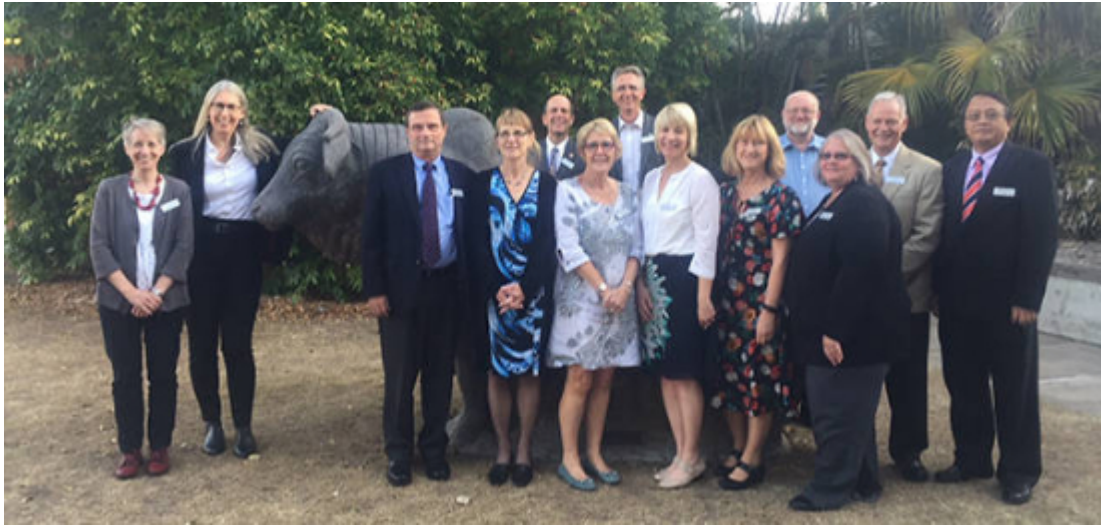
Below- Accreditation Site Team photo 2018

status, they do provide information on how the School has performed against the accreditation standards. There were a small number of issues where the Site Team have asked for further reports over time and some actions, as we expect to arise from such a visit, but the overall result was very positive and a fantastic achievement! The Site Team now report back to their respective accrediting bodies on our performance against the standards and the accrediting bodies make a final ruling on our accreditation status - this is not likely to happen until March-April 2019.